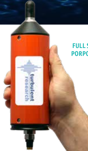
FULL SIZE PORPOISE